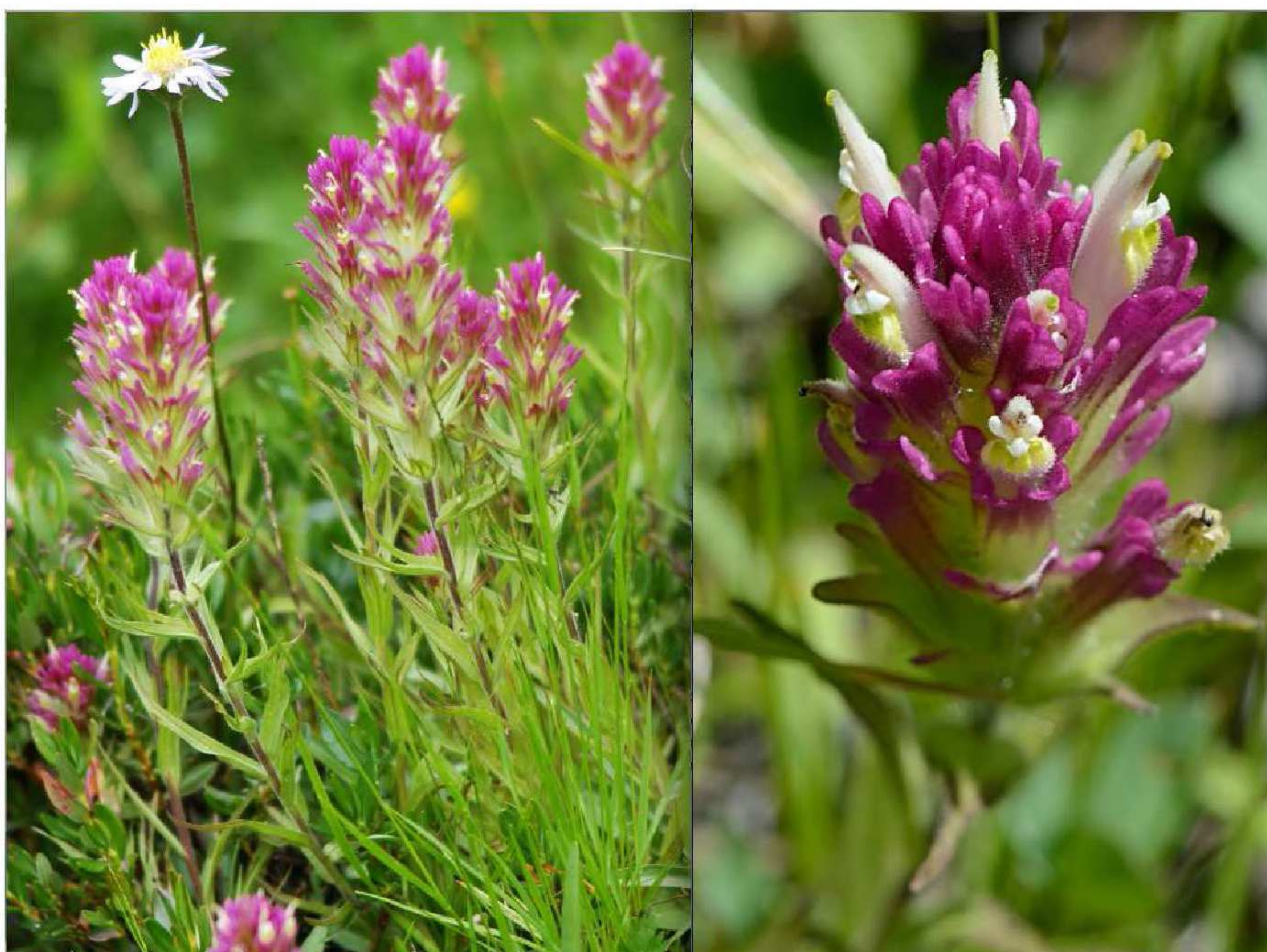
Figure 11. Castilleja lassenensis , Kings Creek Picnic Area, Mt. Lassen National Park, Shasta Co., California, 12 Aug 2004 (left) and 23 Jul 2014 (right).